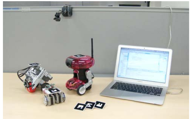
Figure 1 Our toolkit only requires a computer, a web-camera, visual markers, and robots.

To ease this problem, we developed a toolkit to make it easy to write an application that remotely controls mobile robots in a given environment. To achieve our goal, we