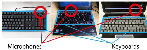
Figure 2. Microphones attached close to keyboards

pressed and surfing is detected from left to right, and zoom out when surfing from right to left.